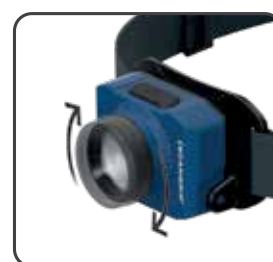
Adjustable beam angle 10°-60°