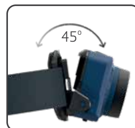
Adjustable lamp head

ZOOM has a modern, streamlined, and compact design with a remarkably low weight, only a little above 100 g which means that you hardly notice you wear it. The 30 mm headband is soft and durable and easy to adjust in the requested length. The lamp head is flexible and can be adjusted 45° to get the best possible lighting angle during work.